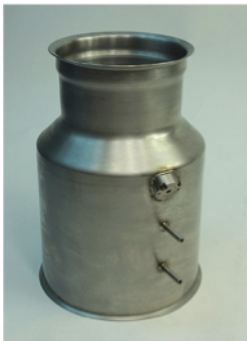
Stainless steel vessel used for Alternative Energy 11.00" height X 8.00" diameter X 18 gage 310 s/s

Helander has the capabilities to deliver high-quality components that conform to rigid specifications. Our outstanding products feature structural integrity to meet the demanding challenges found in the energy sector.