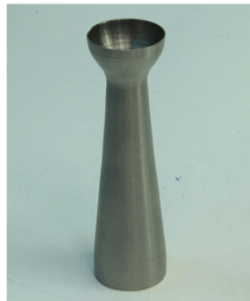
Gas burner tube made out of 16 gage steel tubing 1.00" diameter X 6" long.